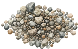
tiny pebbles falling